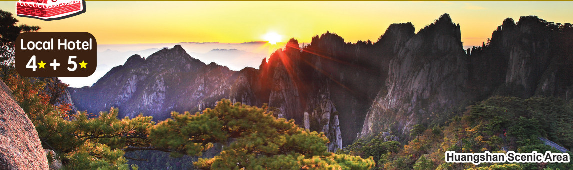
Huangshan Scenic Area