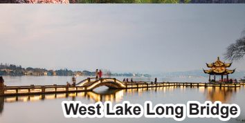
West Lake Long Bridge