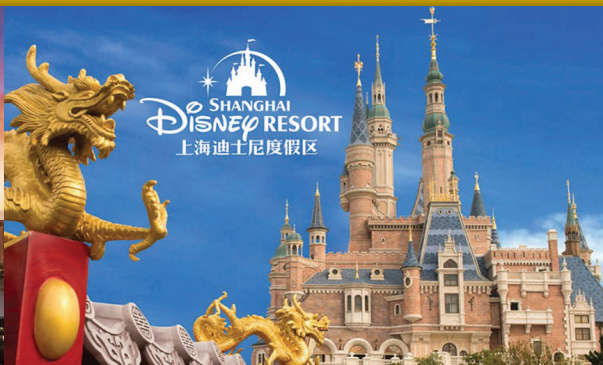
SHANGHAI Disney RESORT 上海迪士尼度假区