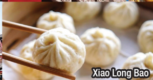
Xiao Long Bao