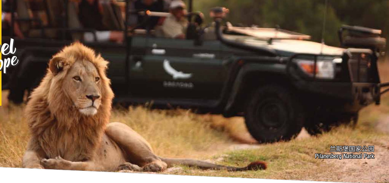
兰斯堡国家公园 Pilanesberg National Park